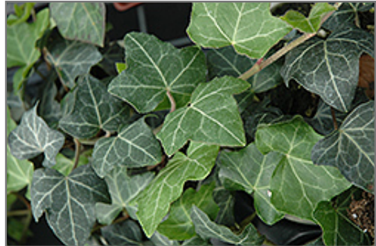
Baltic Ivy foliage