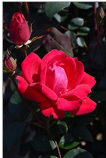
Double Knock Out Rose flowers

Double Knock Out Rose is recommended for the following landscape applications;