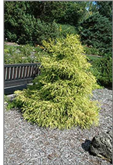
Lemon Thread Falsecypress