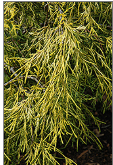
Lemon Thread Falsecypress foliage