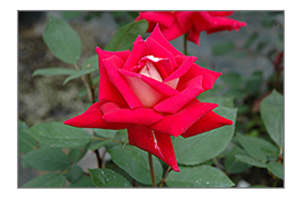
Love Rose flowers

This shrub should only be grown in full sunlight. It does best in average to evenly moist conditions, but will not tolerate standing water. It is not particular as to soil type or pH. It is somewhat tolerant of urban pollution. This particular variety is an interspecific hybrid.