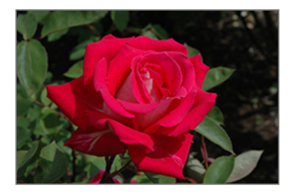
Love Rose flowers

Love Rose is recommended for the following landscape applications;