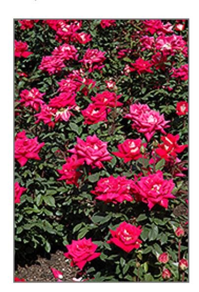
Love Rose flowers

777 Norfolk St N Simcoe, ON N3Y 3R6 p: 519-426-0711 w: ryersegardengallery.com