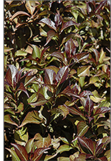
Dark Horse Weigela foliage

Dark Horse Weigela makes a fine choice for the outdoor landscape, but it is also well-suited for use in outdoor pots and containers. Because of its height, it is often used as a 'thriller' in the 'spiller-thriller-filler' container combination; plant it near the center of the pot, surrounded by smaller plants and those that spill over the edges. It is even sizeable enough that it can be grown alone in a suitable container. Note that when grown in a container, it may not perform exactly as indicated on the tag - this is to be expected. Also note that when growing plants in outdoor containers and baskets, they may require more frequent waterings than they would in the yard or garden.