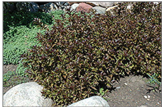
Dark Horse Weigela