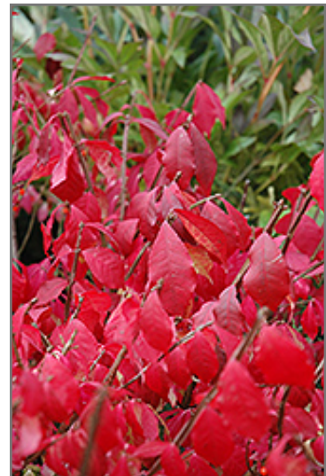
Burning Bush (tree form) in fall