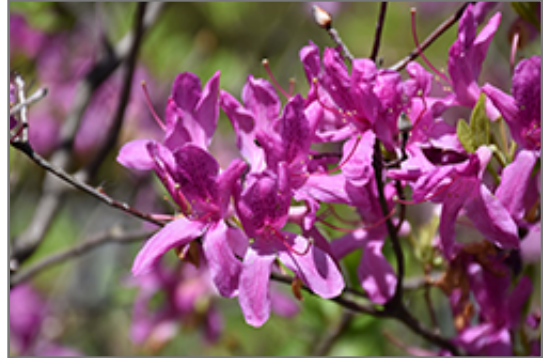
Lilac Lights Azalea flowers