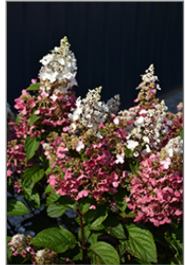
Pinky Winky Hydrangea flowers