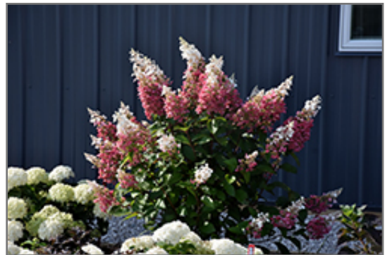
Pinky Winky Hydrangea in bloom