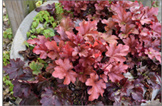
Peach Flambe Coral Bells

Peach Flambe Coral Bells is a fine choice for the garden, but it is also a good selection for planting in outdoor pots and containers. It is often used as a 'filler' in the 'spiller-thriller-filler' container combination, providing a mass of flowers and foliage against which the larger thriller plants stand out. Note that when growing plants in outdoor containers and baskets, they may require more frequent waterings than they would in the yard or garden.