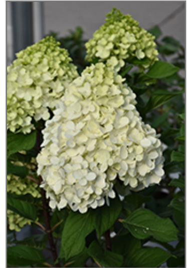
Little Lime Punch Hydrangea flowers