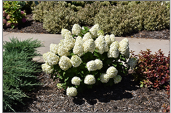
Little Lime Punch Hydrangea in bloom

Little Lime Punch Hydrangea makes a fine choice for the outdoor landscape, but it is also well-suited for use in outdoor pots and containers. With its upright habit of growth, it is best suited for use as a 'thriller' in the 'spiller-thriller-filler' container combination; plant it near the center of the pot, surrounded by smaller plants and those that spill over the edges. It is even sizeable enough that it can be grown alone in a suitable container. Note that when grown in a container, it may not perform exactly as indicated on the tag - this is to be expected. Also note that when growing plants in outdoor containers and baskets, they may require more frequent waterings than they would in the yard or garden.