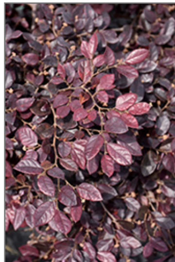
Plum Gorgeous Fringeflower foliage