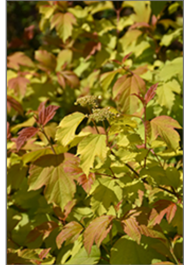
Oh Canada Cranberry Bush foliage

Oh Canada Cranberry Bush is recommended for the following landscape applications;