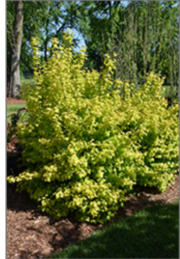
Oh Canada Cranberry Bush

This shrub does best in full sun to partial shade. It prefers to grow in average to moist conditions, and shouldn't be allowed to dry out. It is not particular as to soil type or pH. It is highly tolerant of urban pollution and will even thrive in inner city environments. This is a selected variety of a species not originally from North America.