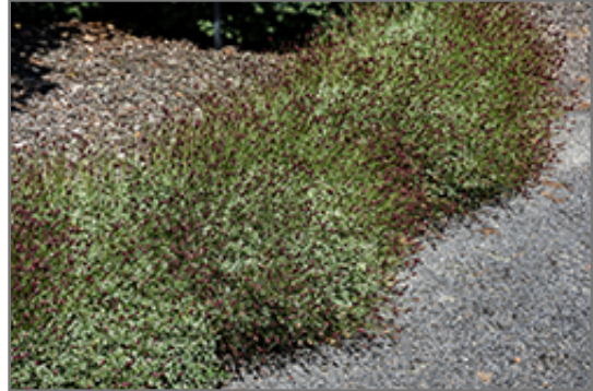
Little Angel Burnet in bloom