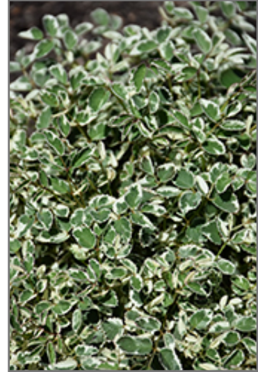
Little Angel Burnet flowers

This plant does best in full sun to partial shade. It prefers to grow in average to moist conditions, and shouldn't be allowed to dry out. It is not particular as to soil type or pH. It is somewhat tolerant of urban pollution. This is a selected variety of a species not originally from North America. It can be propagated by division; however, as a cultivated variety, be aware that it may be subject to certain restrictions or prohibitions on propagation.