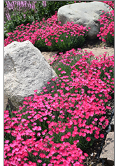
Paint The Town Magenta Pinks in bloom

This is a relatively low maintenance plant, and is best cleaned up in early spring before it resumes active growth for the season. It is a good choice for attracting bees and butterflies to your yard, but is not particularly attractive to deer who tend to leave it alone in favor of tastier treats. It has no significant negative characteristics.