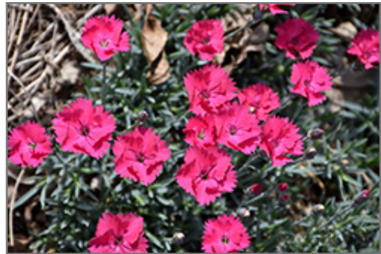
Paint The Town Magenta Pinks flowers