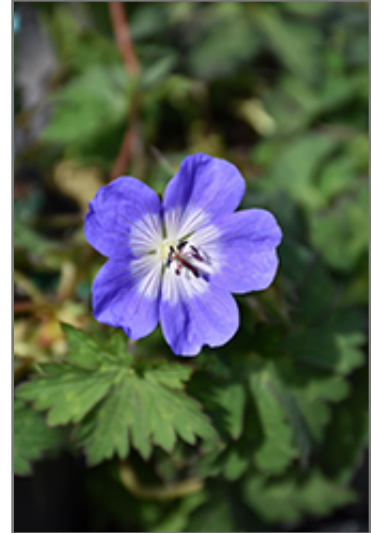
Azure Rush Cranesbill flowers

Azure Rush Cranesbill is recommended for the following landscape applications;