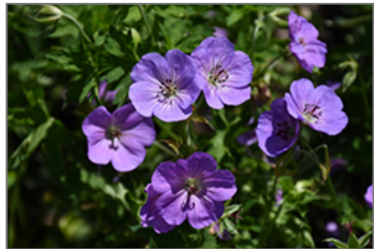
Azure Rush Cranesbill flowers