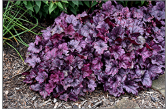
Wild Rose Coral Bells

This is a relatively low maintenance plant, and should be cut back in late fall in preparation for winter. It is a good choice for attracting hummingbirds to your yard. It has no significant negative characteristics.