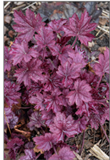
Wild Rose Coral Bells foliage