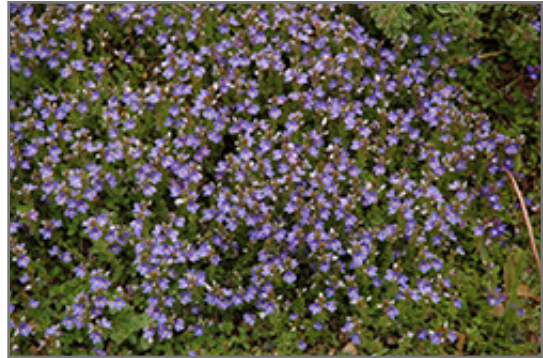
Turkish Speedwell in bloom

Turkish Speedwell is recommended for the following landscape applications;