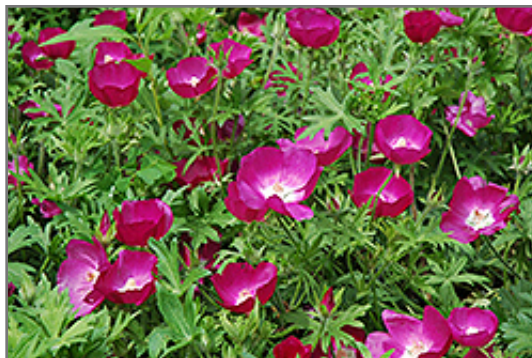
Buffalo Poppy flowers

Buffalo Poppy is recommended for the following landscape applications;