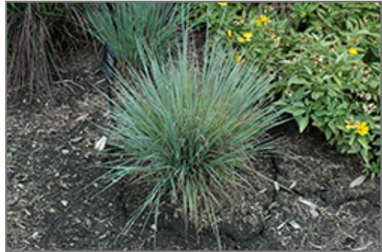
Standing Ovation Bluestem