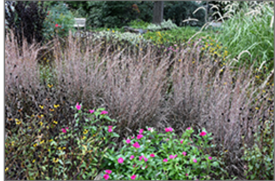
Standing Ovation Bluestem in fall