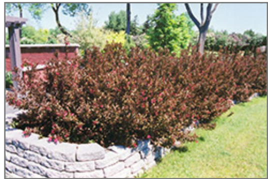
Wine and Roses Weigela