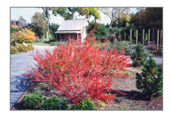
Bridalwreath Spirea in fall

777 Norfolk St N Simcoe, ON N3Y 3R6 p: 519-426-0711 w: ryersegardengallery.com