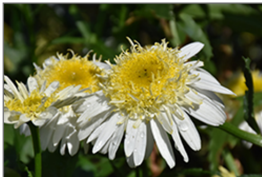
Realflor Real Glory Shasta Daisy flowers

Realflor Real Glory Shasta Daisy is recommended for the following landscape applications;