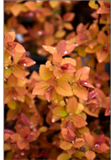
Double Play Big Bang Spirea foliage

This shrub should only be grown in full sunlight. It prefers to grow in average to moist conditions, and shouldn't be allowed to dry out. It is not particular as to soil type or pH. It is highly tolerant of urban pollution and will even thrive in inner city environments. This particular variety is an interspecific hybrid.