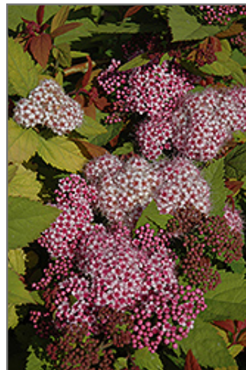
Double Play Big Bang Spirea flowers

Double Play Big Bang Spirea is recommended for the following landscape applications;