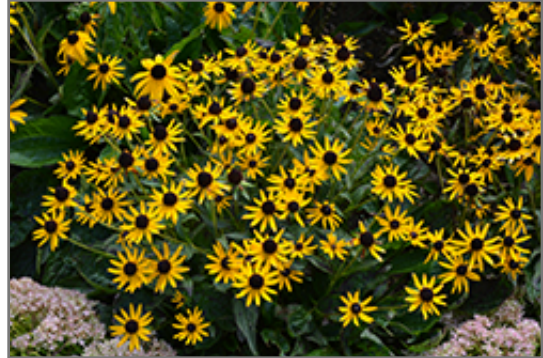
Little Goldstar Coneflower in bloom

This is a relatively low maintenance plant, and should be cut back in late fall in preparation for winter. It is a good choice for attracting butterflies to your yard, but is not particularly attractive to deer who tend to leave it alone in favor of tastier treats. It has no significant negative characteristics.