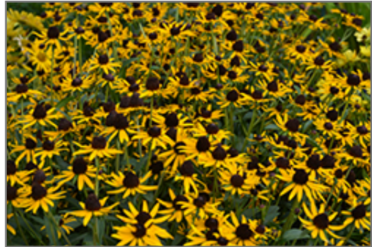
Little Goldstar Coneflower flowers