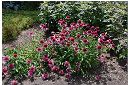
Double Scoop Bubble Gum Coneflower in bloom