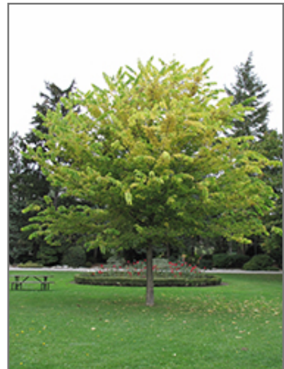
Common Hackberry in fall