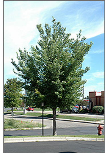
Common Hackberry