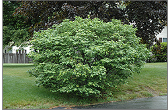
Compact Winged Burning Bush

Compact Winged Burning Bush will grow to be about 7 feet tall at maturity, with a spread of 7 feet. It tends to fill out right to the ground and therefore doesn't necessarily require facer plants in front, and is suitable for planting under power lines. It grows at a slow rate, and under ideal conditions can be expected to live for 50 years or more.