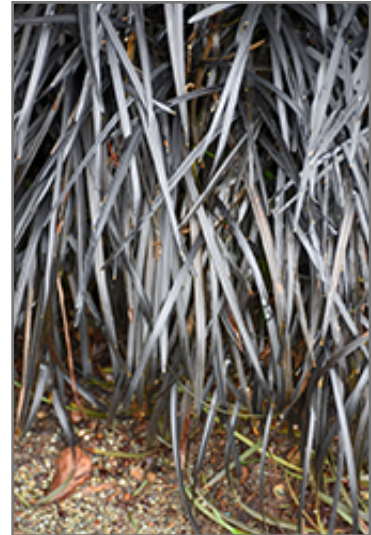
Black Mondo Grass foliage

Black Mondo Grass is a fine choice for the garden, but it is also a good selection for planting in outdoor pots and containers. It is often used as a 'filler' in the 'spiller-thriller-filler' container combination, providing a mass of flowers and foliage against which the thriller plants stand out. Note that when growing plants in outdoor containers and baskets, they may require more frequent waterings than they would in the yard or garden.