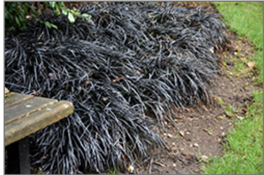
Black Mondo Grass