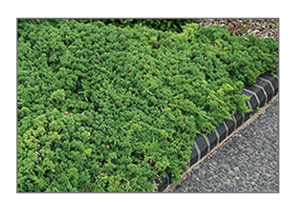
Green Mound Dwarf Japanese Juniper