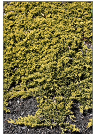
Mother Lode Juniper foliage