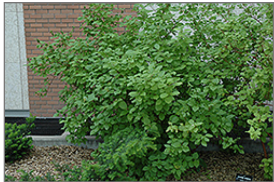
Siberian Dogwood