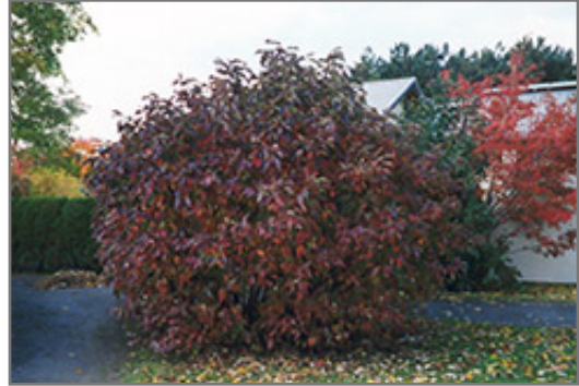
Siberian Dogwood in fall

This shrub does best in full sun to partial shade. It is an amazingly adaptable plant, tolerating both dry conditions and even some standing water. It is not particular as to soil type or pH. It is highly tolerant of urban pollution and will even thrive in inner city environments. This is a selected variety of a species not originally from North America.