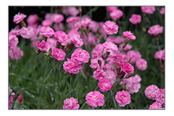
Tiny Rubies Dwarf Mat Pinks flowers

777 Norfolk St N Simcoe, ON N3Y 3R6 p: 519-426-0711 w: ryersegardengallery.com