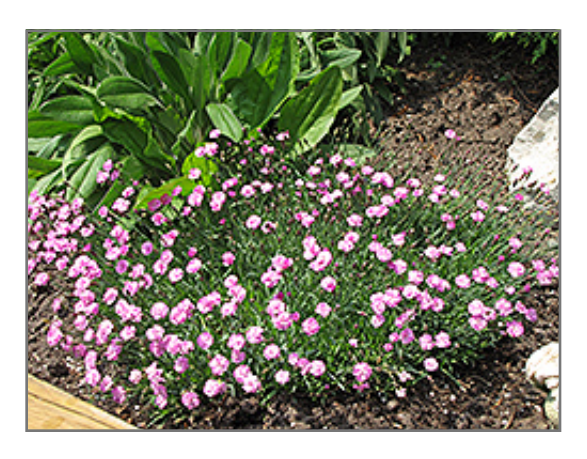
Tiny Rubies Dwarf Mat Pinks in bloom