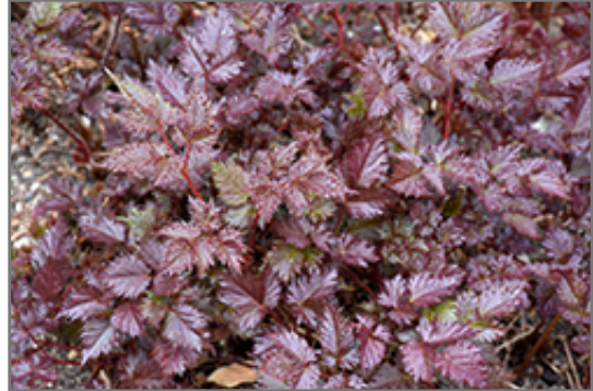
Delft Lace Astilbe foliage

Delft Lace Astilbe will grow to be about 16 inches tall at maturity extending to 24 inches tall with the flowers, with a spread of 12 inches. When grown in masses or used as a bedding plant, individual plants should be spaced approximately 12 inches apart. Its foliage tends to remain dense right to the ground, not requiring facer plants in front. It grows at a medium rate, and under ideal conditions can be expected to live for approximately 10 years. As an herbaceous perennial, this plant will usually die back to the crown each winter, and will regrow from the base each spring. Be careful not to disturb the crown in late winter when it may not be readily seen!