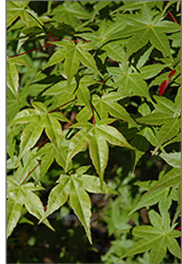
Shindeshojo Japanese Maple foliage