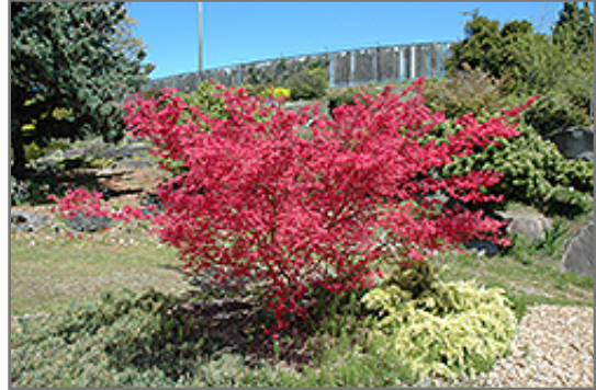
Shindeshojo Japanese Maple in spring

This tree does best in full sun to partial shade. You may want to keep it away from hot, dry locations that receive direct afternoon sun or which get reflected sunlight, such as against the south side of a white wall. It prefers to grow in average to moist conditions, and shouldn't be allowed to dry out. It is not particular as to soil pH, but grows best in rich soils. It is somewhat tolerant of urban pollution, and will benefit from being planted in a relatively sheltered location. Consider applying a thick mulch around the root zone in winter to protect it in exposed locations or colder microclimates. This is a selected variety of a species not originally from North America.