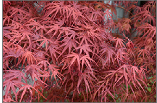
Beni Otake Japanese Maple foliage