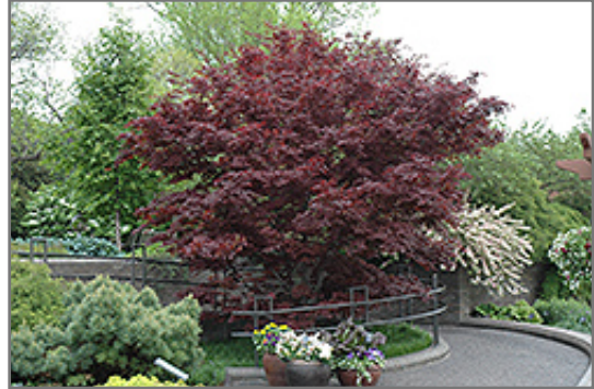
Bloodgood Japanese Maple