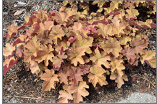
Caramel Coral Bells

Caramel Coral Bells will grow to be about 10 inches tall at maturity extending to 18 inches tall with the flowers, with a spread of 18 inches. When grown in masses or used as a bedding plant, individual plants should be spaced approximately 15 inches apart. Its foliage tends to remain low and dense right to the ground. It grows at a medium rate, and under ideal conditions can be expected to live for approximately 10 years. As an evergreen perennial, this plant will typically keep its form and foliage year-round.