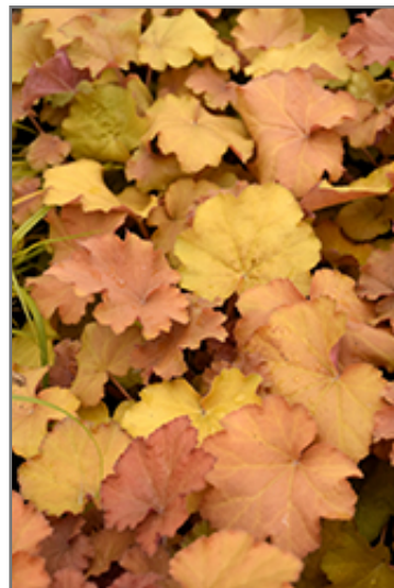
Caramel Coral Bells foliage

Caramel Coral Bells is recommended for the following landscape applications;