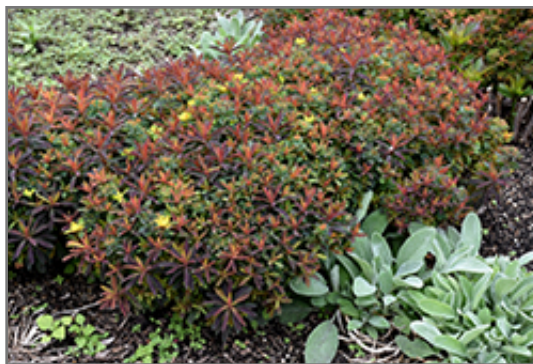
Bonfire Cushion Spurge