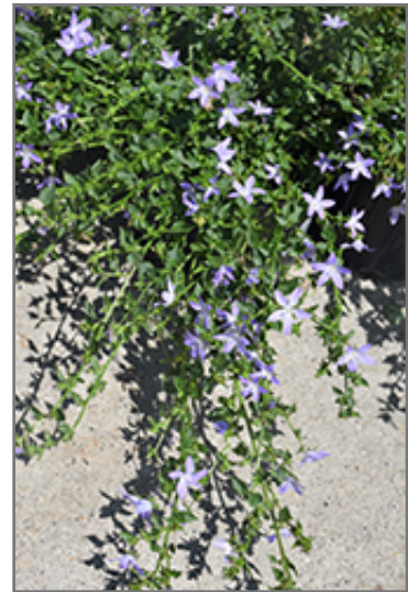
Blue Waterfall Serbian Bellflower in bloom