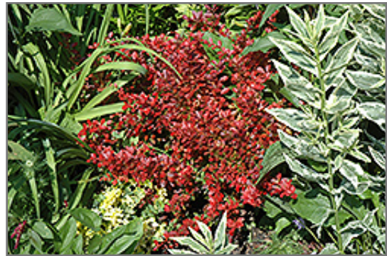
Cherry Bomb Japanese Barberry