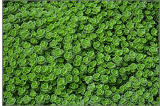
John Creech Stonecrop foliage

John Creech Stonecrop will grow to be only 3 inches tall at maturity, with a spread of 12 inches. When grown in masses or used as a bedding plant, individual plants should be spaced approximately 10 inches apart. Its foliage tends to remain low and dense right to the ground. It grows at a fast rate, and under ideal conditions can be expected to live for approximately 10 years. As an herbaceous perennial, this plant will usually die back to the crown each winter, and will regrow from the base each spring. Be careful not to disturb the crown in late winter when it may not be readily seen!