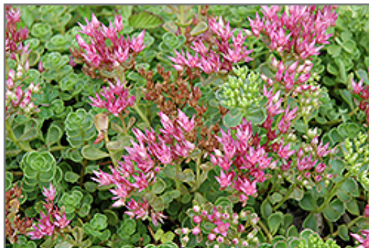
John Creech Stonecrop flowers

John Creech Stonecrop is recommended for the following landscape applications;