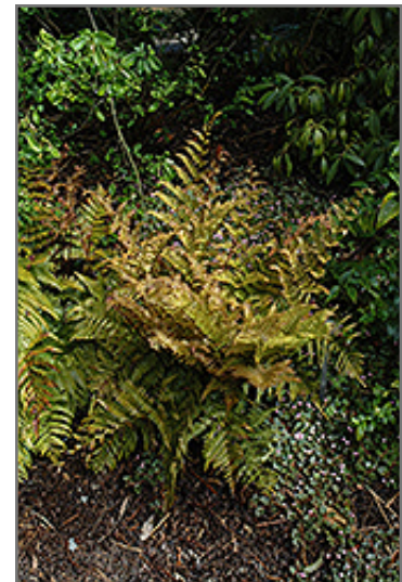
Autumn Fern