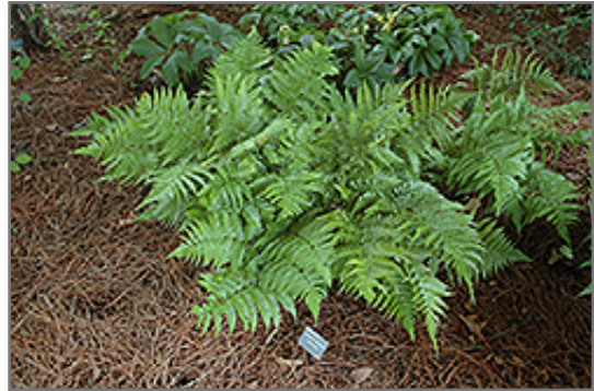
Autumn Fern

Autumn Fern is a fine choice for the garden, but it is also a good selection for planting in outdoor pots and containers. Because of its spreading habit of growth, it is ideally suited for use as a 'spiller' in the 'spiller-thriller-filler' container combination; plant it near the edges where it can spill gracefully over the pot. Note that when growing plants in outdoor containers and baskets, they may require more frequent waterings than they would in the yard or garden.