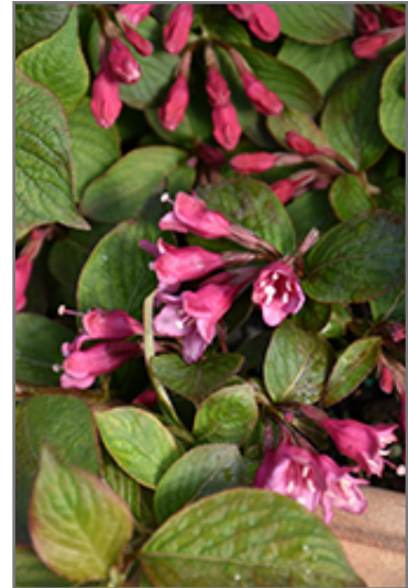
Midnight Sun Reblooming Weigela flowers

Midnight Sun Reblooming Weigela makes a fine choice for the outdoor landscape, but it is also well-suited for use in outdoor pots and containers. It is often used as a 'filler' in the 'spiller-thriller-filler' container combination, providing a mass of flowers and foliage against which the thriller plants stand out. Note that when grown in a container, it may not perform exactly as indicated on the tag - this is to be expected. Also note that when growing plants in outdoor containers and baskets, they may require more frequent waterings than they would in the yard or garden.