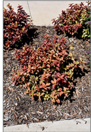
Midnight Sun Reblooming Weigela