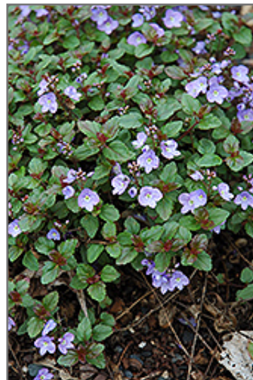
Waterperry Blue Speedwell in bloom