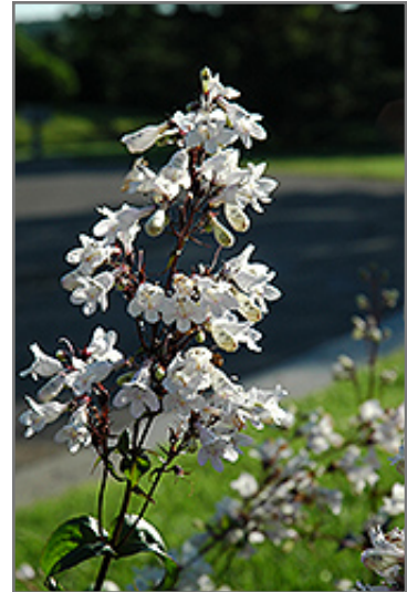
Husker Red Beard Tongue flowers