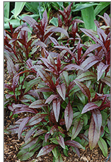
Husker Red Beard Tongue foliage