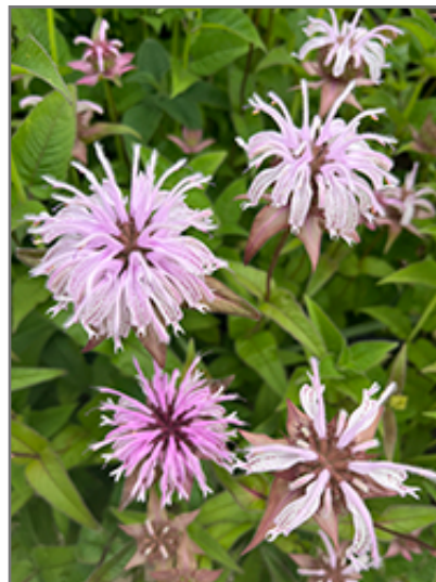
Eastern Beebalm flowers

This plant will require occasional maintenance and upkeep, and should be cut back in late fall in preparation for winter. It is a good choice for attracting bees, butterflies and hummingbirds to your yard, but is not particularly attractive to deer who tend to leave it alone in favor of tastier treats. Gardeners should be aware of the following characteristic(s) that may warrant special consideration;