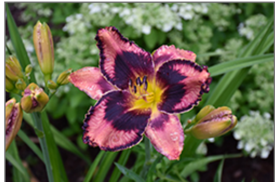
Rainbow Rhythm Storm Shelter Daylily flowers