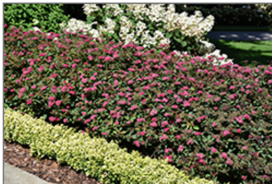
Double Play Doozie Spirea in bloom

This shrub will require occasional maintenance and upkeep, and is best pruned in late winter once the threat of extreme cold has passed. It is a good choice for attracting butterflies to your yard, but is not particularly attractive to deer who tend to leave it alone in favor of tastier treats. It has no significant negative characteristics.