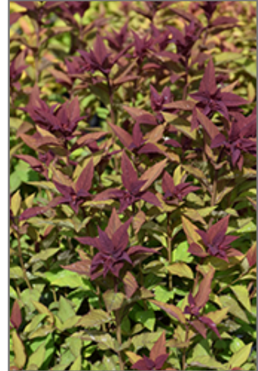
Double Play Doozie Spirea foliage

This shrub should only be grown in full sunlight. It prefers to grow in average to moist conditions, and shouldn't be allowed to dry out. It is not particular as to soil type or pH. It is highly tolerant of urban pollution and will even thrive in inner city environments. This particular variety is an interspecific hybrid.