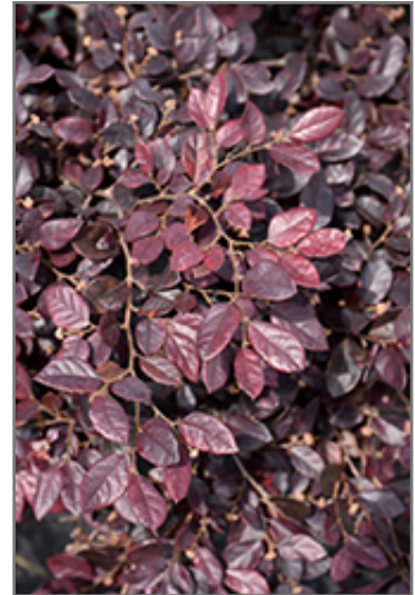
Plum Gorgeous Fringeflower foliage