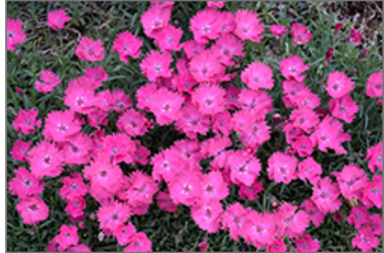
Vivid Bright Light Pinks flowers

Vivid Bright Light Pinks is recommended for the following landscape applications;